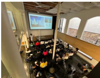
Lecture about Barcelona

3 courses of the School of Architecture jointly organized an overseas program in Barcelona, Spain, for second-year undergraduate students and 29 students participated in the program. The program was developed together with the Barcelona Architecture Center (BAC), and consisted mainly of architectural tours in Barcelona, free architectural tours in groups, suburban architectural tours, and architectural design exercises. In the design exercise, groups of three or four students worked on a facility of accommodation on a site of the coast of Barcelona, and all students gave presentations in English at the final review session. The task seemed challenging for second-year students in an unfamiliar environment and in an unfamiliar place, but with the dense guidance of the BAC and the high motivation of the participating students, all groups were able to complete excellent works and achieve their goals. It was a very intense two weeks and an exciting program for the participating students. □