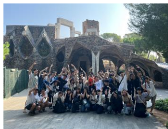
Tour Colonia Guell