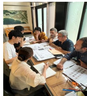
Esquisse by BAC professor