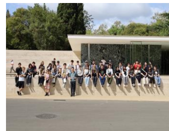
Tour Barcelona Pavilion