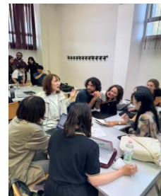
Discussions during the workshop