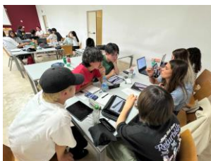
Debates using English and sketches