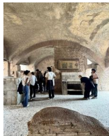
At the excavation site of Ostia Antica's shops