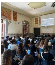
Guidance at the University of Rome

In collaboration with Italian and Japanese teams, we explored proposals for civil engineering infrastructure at a macro scale, alongside adaptable wooden infill solutions. The program included workshops for proposal development, as well as numerous site visits aimed at understanding the evolution of society and architecture from ancient Rome to the present day, resulting in a rich and comprehensive learning experience.