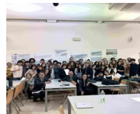
Concluding the workshop presentations