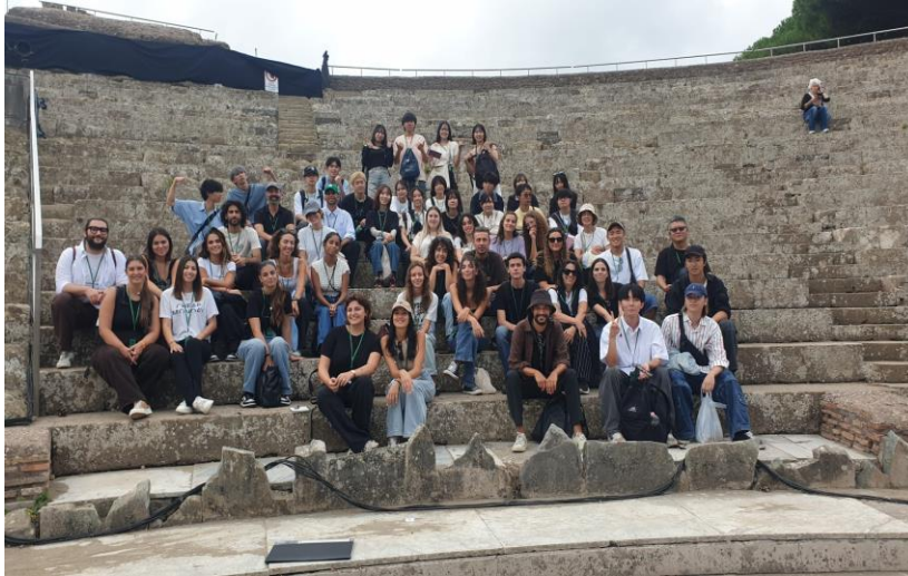
At the outdoor theater of the ancient ruins of Ostia Antica

This joint program with the Faculty of Architecture at the University of Rome, which boasts one of the most distinguished histories in Europe, was conducted in Rome for the 2024 academic year. The site proposed for redevelopment is a flood-prone fishing village area located near the ancient ruins of Ostia Antica, at the mouth of the Tiber River in the heart of Rome.