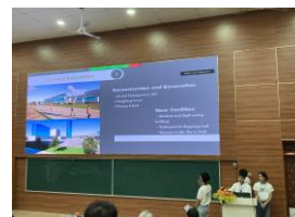
Presentation of results 1