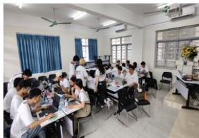
Scenes from the workshop 2

At the University of Transport and Communications (UTC) in Hanoi, Vietnam, a joint international workshop on construction production was conducted with 22 undergraduate students from UTC's Construction Management Department, 22 undergraduate and graduate students majoring in Architectural Production from Shibaura Institute of Technology (SIT), and one graduate student from Tunku Abdul Rahman University of Management and Technology (TAR UMT) in Malaysia. The workshop's theme was to plan the area around the Cau Giay Station of the Hanoi Urban Railway Line 3, which began operation in August 2024, using "Future Design" methods and the concept of Transit-Oriented Development (TOD), while modeling with BIM software. Students from UTC, specializing in transportation, collaborated in six mixed teams with SIT and TAR UMT students to brainstorm ideas and develop plans, culminating in high-quality presentations over four days of work. During the results presentation, special lectures were given by representatives from JR East Design, the Vietnam Institute of Urban and Rural Planning, Oriental Consultants Global, and Baezeni 3D Engineering. Additionally, a group awarded for excellence by faculty evaluation received a certificate from the Vice General Director of Hanoi Metropolitan Railway Management Board. The participants also visited local sites such as the Ethnology Museum and the ancient capital of Hoa Lu, making for a fulfilling global PBL experience.