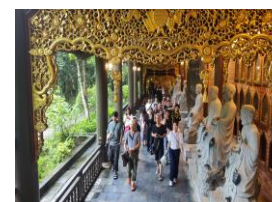
Inspection of Baidin Temple