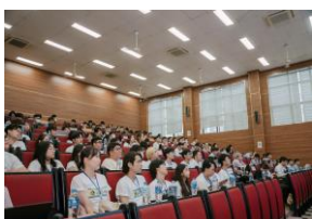
Presentation of results 2