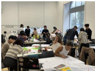
Workshop and discussion

As an instructor I believe this program provided a very good opportunity for students of both schools to develop friendship, to learn how to collaborate with those have different background, and gained confidence by completing the task.