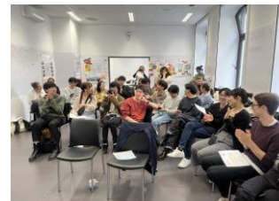
Final presentation room