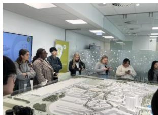
Visits and descriptions of new large-scale urban development sites