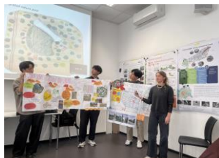
Final results of the workshop